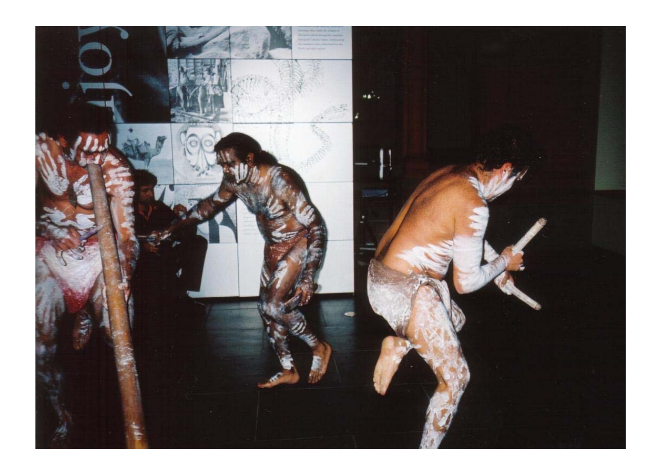
Fig 1: Kaurna Dancers at the South Australian Museum.